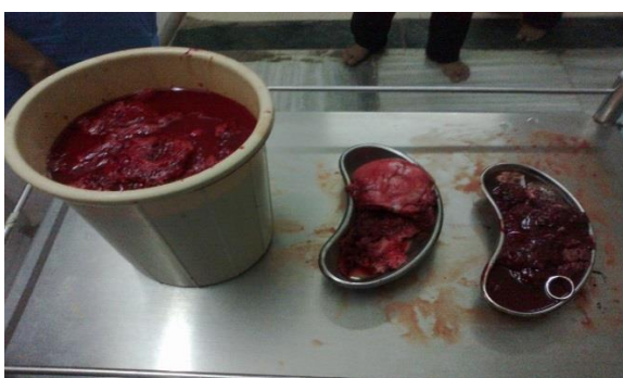
Fig. 2: Total blood loss during surgery